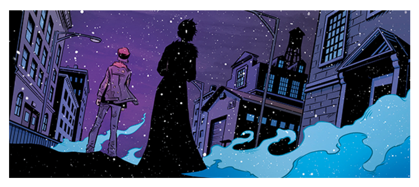
The Eyes of the People features 30 all-new pages with striking artwork from the team that brought you The Pit and A Spy in the House of Long.